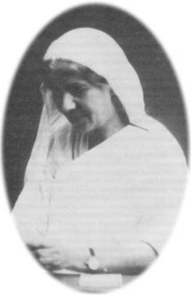
Amy Carmichael, age 57 (1925), in Indian dress

In Isaiah 44:3-4 we have a beautiful promise that I feel is given in the context of revival. May I be so bold as to ask you to stop and read these two verses out loud? Think about your children as you read.