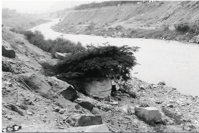
Some 2,000 children live in improvised shelters like this one along the Rimac River that flows through Lima, Peru. In the bottom photo (and the front cover), Chris Armstrong shares a snack with the boys and the one 9-year-old girl (in blue on cover photo) that lived with them.

to work with them, it takes a lot of patience. When I worked in one orphanage here, we would go from 7 am to midnight, full speed. The children would spit and fist fight. They would even pull a knife if they had one, and one even used a fork on me one time. One 8- or 9-year-old boy would get angry every time I talked to one of the female staff. I asked