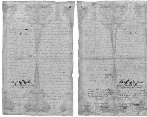
A few Quakers and Mennonites framed this first public antislavery statement in North America, in 1688. It was a statement that clashed with the kingdoms of this world.

During the next 150 years, some of the American colonies and the later United States of America would make it illegal for anyone to help a slave escape. George Washington himself (who owned or leased over 300 slaves at his death) had signed the 1793 Fugitive Slave Act that slapped a $500 fine (appr. $50,000 in today’s value) on those who “shall harbor