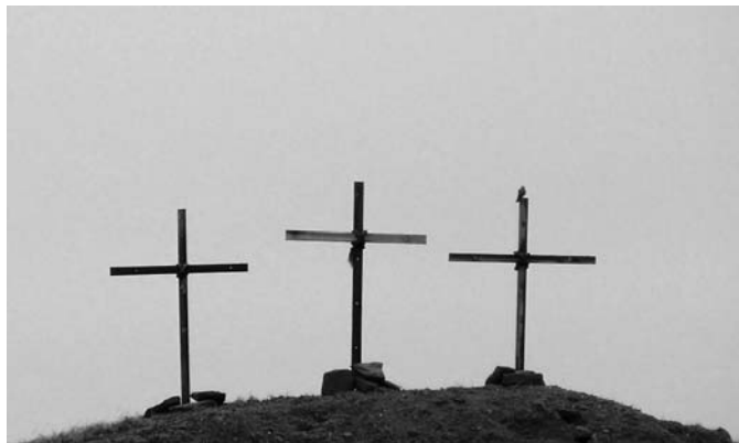
Paul didn't opt for this theological, iconic cross.

Too many Christians still live fundamentally like the Jews, Greeks, and Romans of the first century—preoccupied with law, wisdom, and power. Many of us have reverted to conventional answers for conventional problems. The “otherness” of the cross has been neglected in favor of humanly native thought patterns; and the cross is a shelf item, not something that is seared into our hearts and lifestyle.