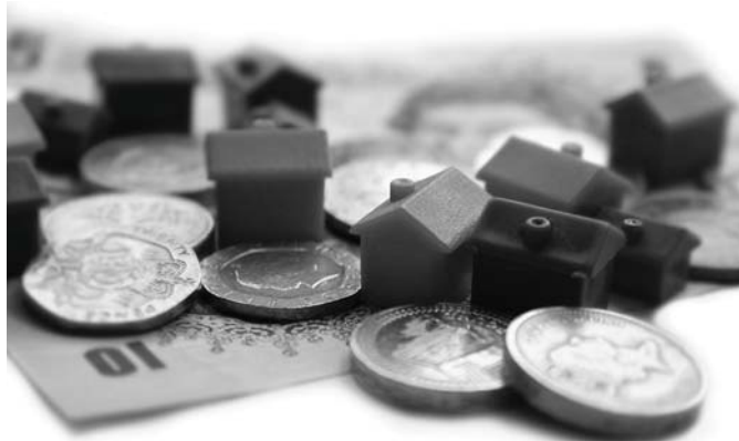
Men with crosses on their shoulder are seldom impressed with wealth.

No wonder that Jesus said, many years ago, that being a disciple depends on our willingness to "take up the cross and follow" Him. In other words, our lives should be defined by the cross on our shoulder or the stigma in our hands.