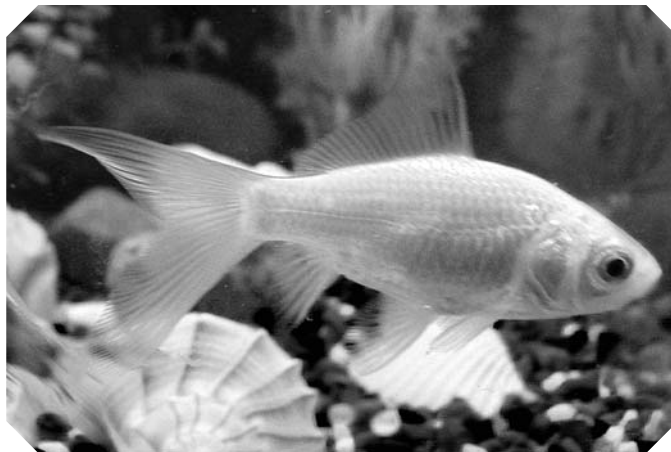
Fish don’t “go swimming”!

So it is with man. Man worships something. He was made to worship. The problem is not that man sometimes quits worshipping, but that he worships the wrong thing.