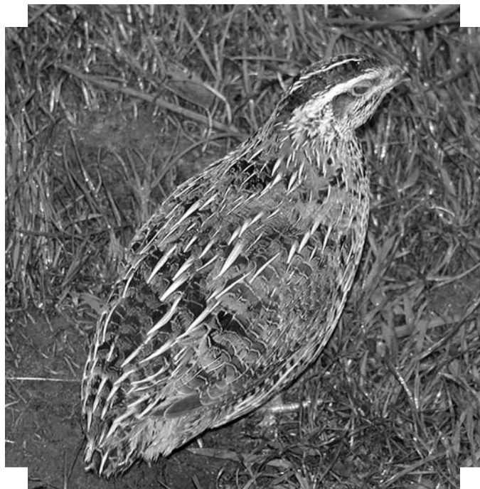
Meat is not a bad thing, yet because of the manner in which they desired meat, it became idolatry.

Worship to God can be compared to marriage. The greatest safeguard against adultery is to be happily ful-