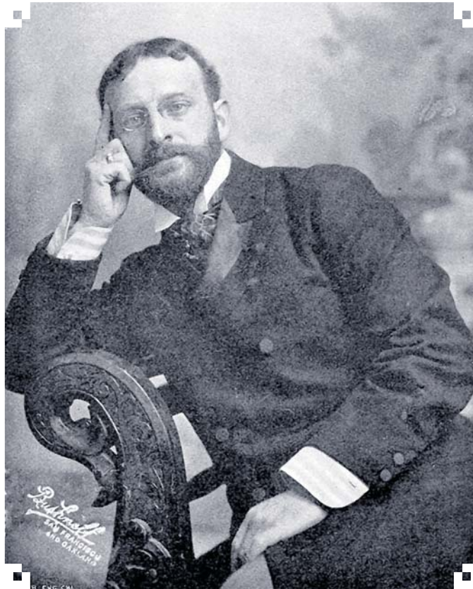
"Doctor" Albert Abrams, "dean of the 20-century charlatans," invented some "black boxes" that were [supposedly] based on a type of radiesthesia. To buy one of his machines, the buyer had to sign a contract that he would never open it up to look inside!

Red flags went off in my mind when I heard these things. The tracker, it seemed to me, was nothing but a souped-up version of an old-fashioned dowsing rod. Supposedly, there was some pretty sophisticated electronic equipment in the handle of the tracker. My doubts were deepened when the person told me, "Even the maker of