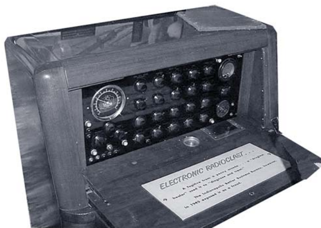
This “Radioclast” (possibly built by Albert Abrams) sits in a museum as an example of black box quackery. If “black boxes” do work, they work outside of the known laws of physics, in the spiritual realm.