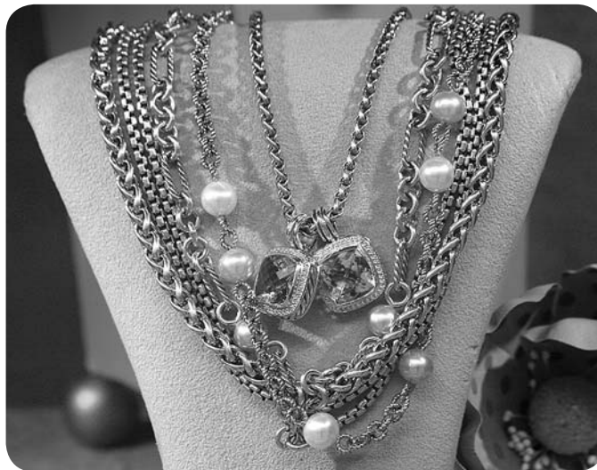
The jewels of modesty, shamefacedness, sobriety, faith, charity, peace, righteousness, meekness, and quietness are truly jewels of great price.