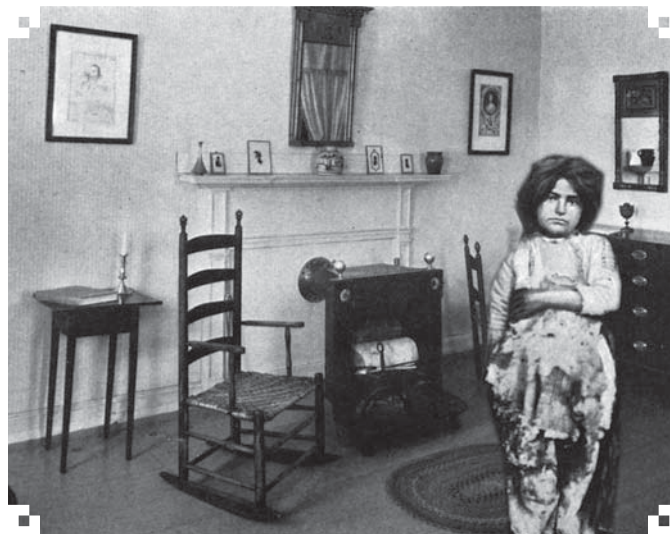
O justice! O mercy! Are not these pictures the blood of this poor maid?

Let’s turn now to Isaiah 58:10-11 and consider some tremendous promises, given in the context of fasting. “And if thou draw out thy soul to the hungry, and satisfy the afflicted soul; then shall thy light rise in obscurity.” John Wesley didn’t live in obscurity. Everybody knew