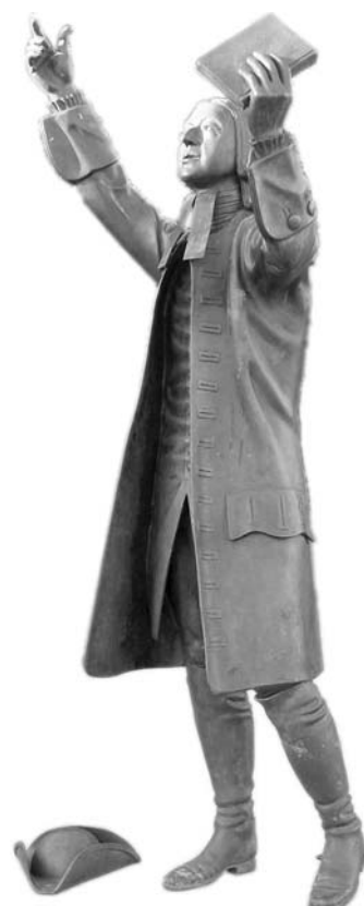
Anybody in need captured John Wesley's heart.

Looking again at verse 19, we see the words “according to his riches.”