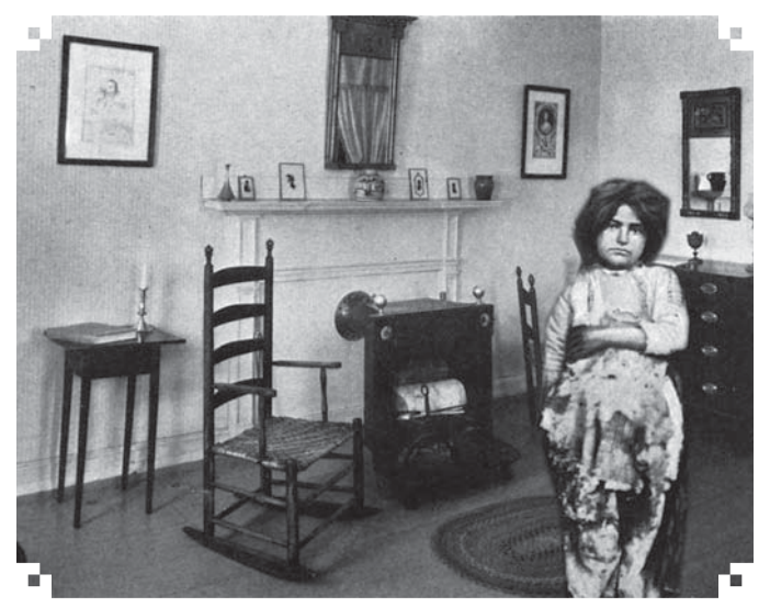
O justice! O mercy! Are not these pictures the blood of this poor maid?

Let's turn now to Isaiah 58:10-11 and consider some tremendous promises, given in the context of fasting. "And if thou draw out thy soul to the hungry, and satisfy the afflicted soul; then shall thy light rise in obscurity." John Wesley didn't live in obscurity. Everybody knew