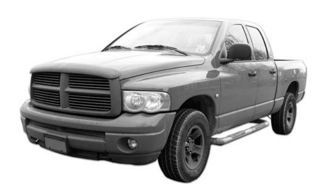
Is it that extravagant automobile that you really don't need? Isn't it far more than mere transportation?

By the way, how much do you put into your front lawn? I cannot imagine the amount of money people put into their lawns.