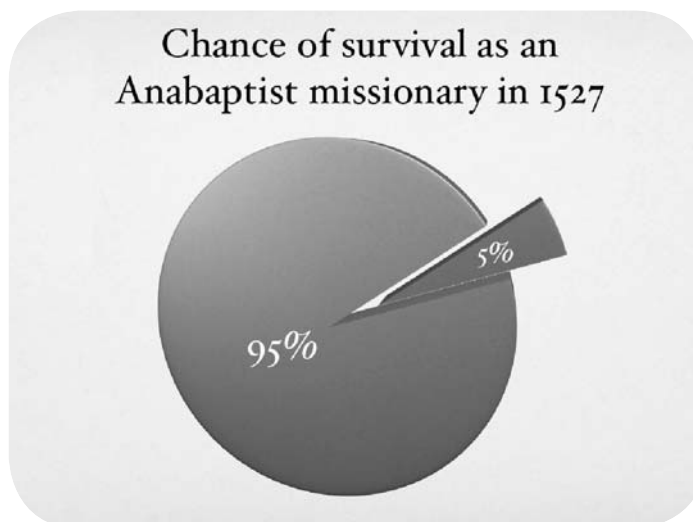
58 out of 60 missionaries who attended the Anabaptist “Martyrs’ Synod” in 1527 were martyred within five years.

was almost completely Anabaptist. Liechtenstein himself was even re-baptized. Unfortunately, however, the peace was short lived. The Muslim leader Suleiman the Magnificent had pronounced a holy war—Jihad—on Christian Europe. Inadvertently, these Moravian Anabaptists found themselves on the front line. With the fear of enemy attack and pressure from superior nobility, Liechtenstein ordered all citizens to wear the sword and be ready to defend the country at all times. Sad to say, most of the Anabaptists of this first wave consented