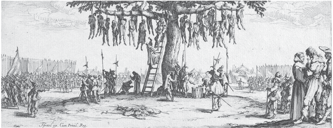
"The Hanging," by Jacques Callot, graphically displays the miseries of the Thirty Years' War.

plundered the countryside as they passed back and forth as a part of their "pay." Unfortunately, both sides attacked the Anabaptists. In the section of the Hutterian Chronicle that covers this time period, the writer gives graphic details of the suffering that they endured. Some of the details are so bad that I had to mark warning signs on some of the pages of my copy. Whole communities were wiped out in a day. If there was any time for a community to "hide out and play it safe," it was then. But unbelievably, even through this time period the Hutterites kept the mission outreach going! Writing in the year 1620, right after describing terrible atrocities, the Chronicle records: