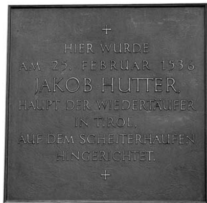
Plaque in Vienna, Austria, placed as a memorial to the execution of Jakob Hutter.